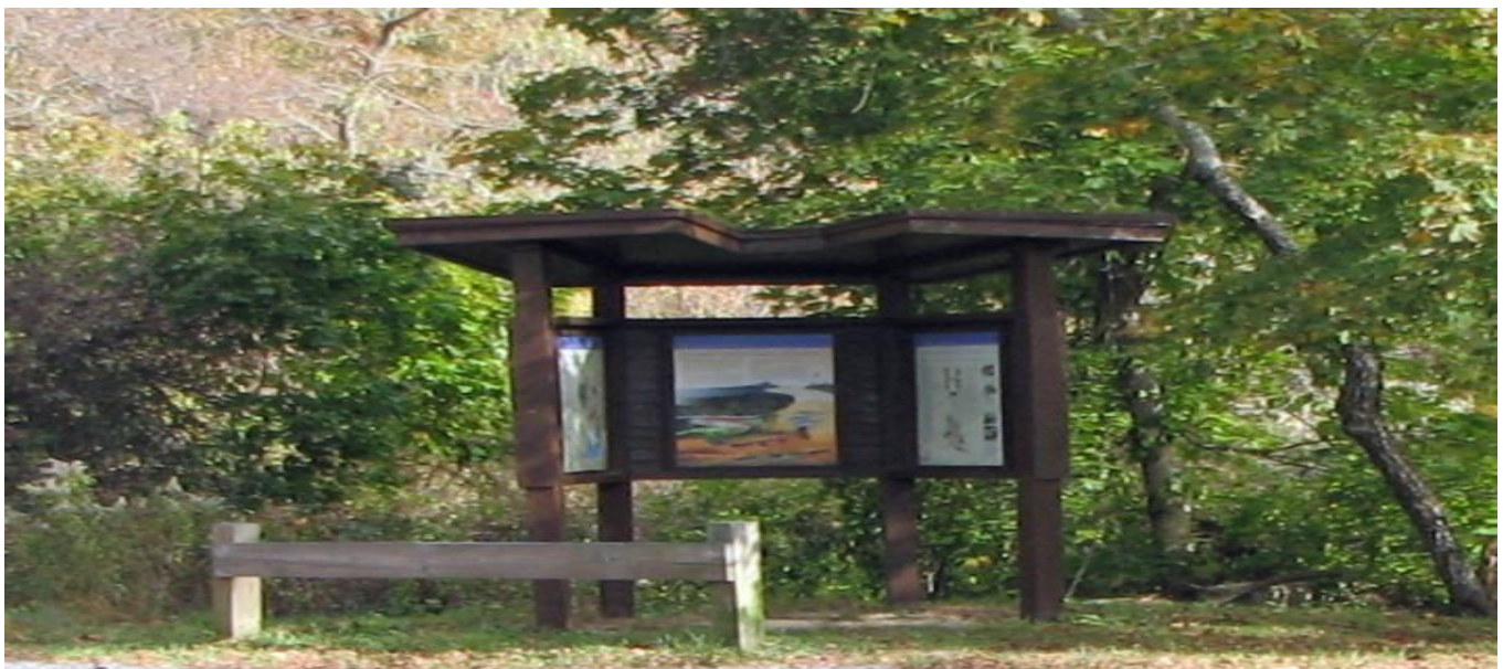
Kiosk at Martin Road parking area. Quashnet River.