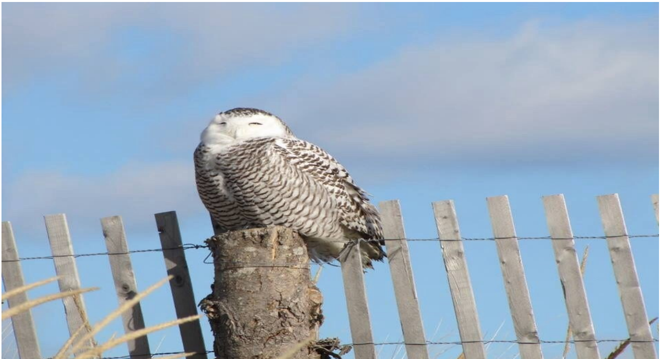
Snowy Owl Red River Beach, Harwich

**** Red is having computer problems..... Random Casts will not be the same until he's back on-line. We're all hoping the issue is resolved soon! ****