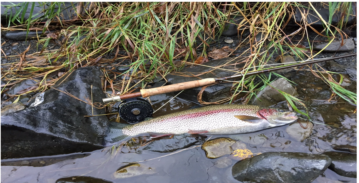
Russian River Rainbow Trout caught this Fall by one of our members