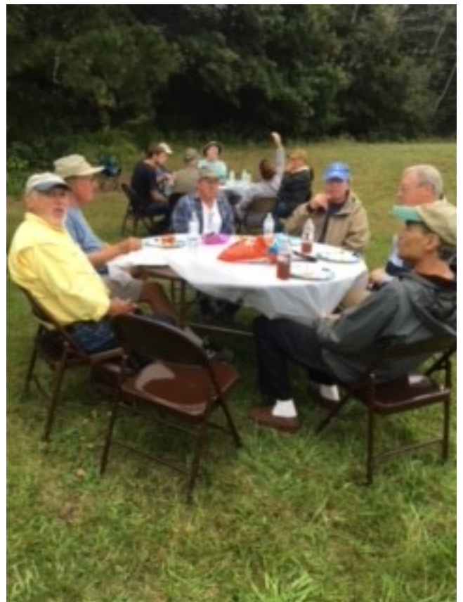
A few of our members enjoying the food and conversation.